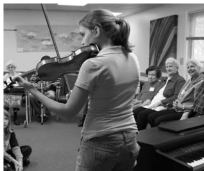
One of the students from Chapel Hill Homeschoolers plays her violin during a monthly music/sing-along program.

Student Volunteers. Periodically, student groups will join in the life of Charles House, sometimes for class work, service credits or scout projects. Local school programs that include Charles House are the Lerner Day School, McDougal Middle