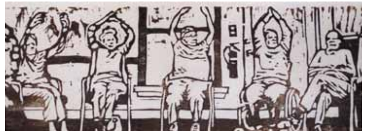
“A Day at Charles House” (2009) Woodcut

Associate Chair, Department of Family Medicine, UNC