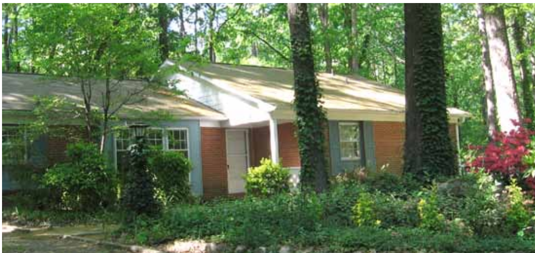
Charles House Eldercare Home - 303 Yorktown