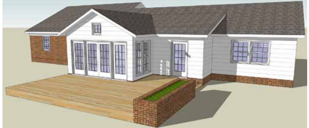
Charles House-Yorktown: Rear View