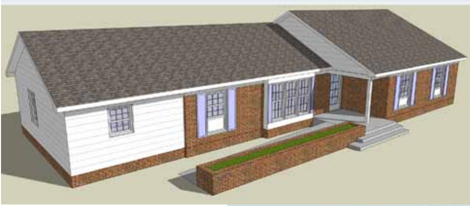
Charles House-Yorktown: Front View