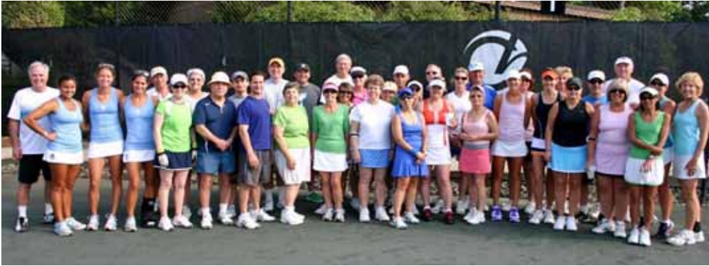
Players and Pros get ready for action at the Chapel Hill Country Club